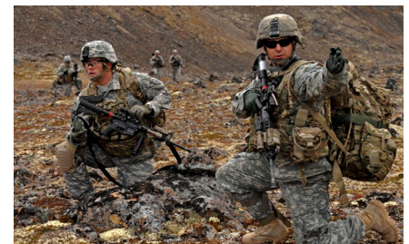
Soldiers from 1st Squadron (Airborne), 40th Cavalry Regiment train in preparation for deployment at Joint Base Elmendorf-Richardson.